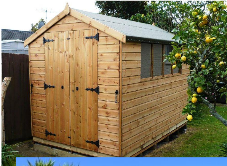
1.800 x 3.000 Premier Apex Shed