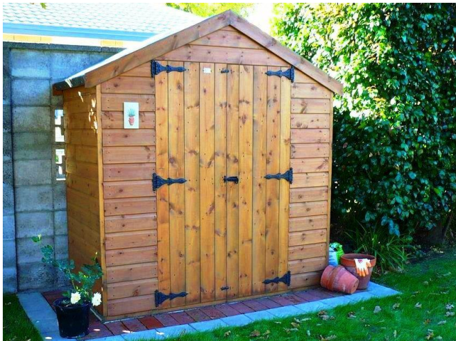
Above & below is a 1800 x .900 Apex Tidy.