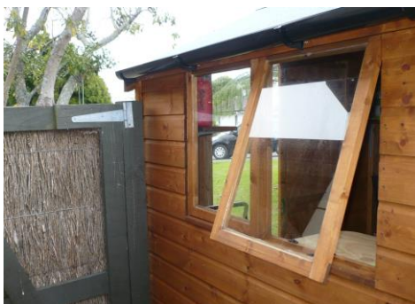
Above is an optional opening Sash